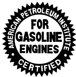
API CERTIFICATION MARK